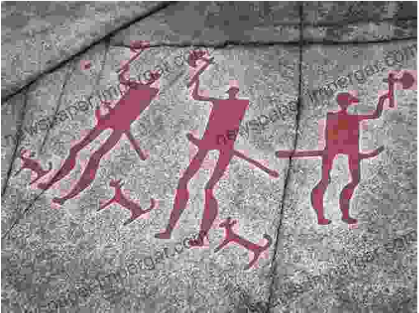
Figure 2: Iron Age carving showcasing warriors and weapons

Images of weapons, warriors, and battle scenes grew in prevalence, mirroring the increasing emphasis on warfare and territorial disputes during the Iron Age. The addition of human figures suggests the emergence of social hierarchies and the development of more complex societal structures.