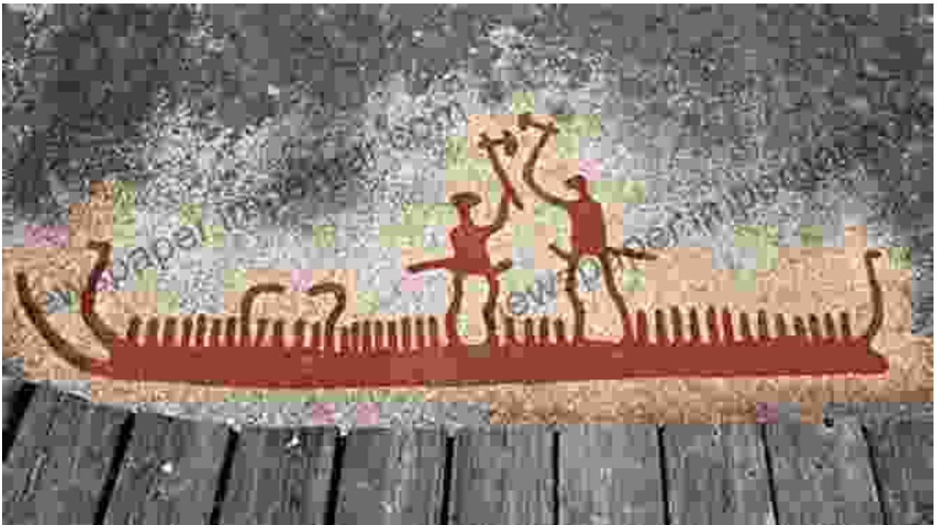
Figure 1: Bronze Age carving featuring ships and animals

Ships, a prominent motif in Bronze Age rock carvings, symbolize the importance of maritime trade and exploration. Animals, such as deer, horses, and cattle, reflect the agricultural and pastoral nature of the society. Intricate geometric patterns, including spirals and circles, hint at spiritual beliefs and astronomical observations.